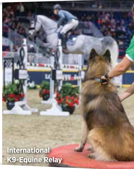
International K9-Equine Relay