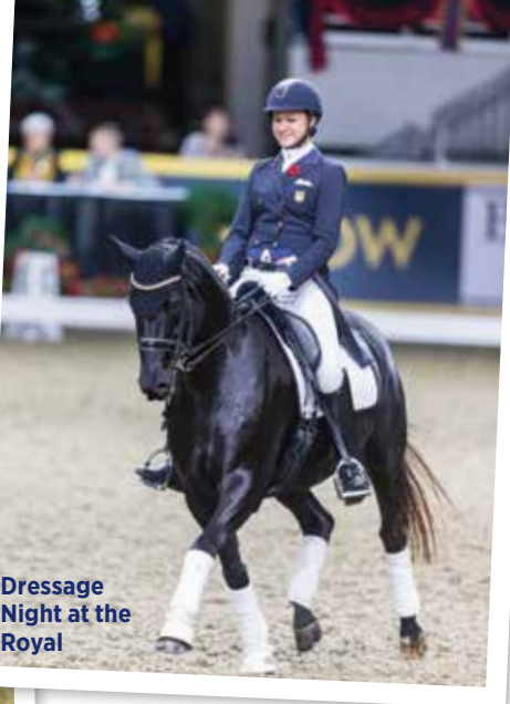
Dressage Night at the Royal