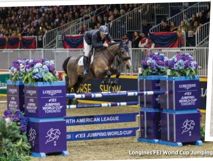
Longines FEI World Cup Jumping