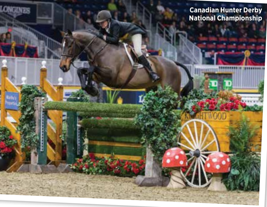
Canadian Hunter Derby National Championship