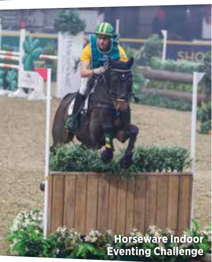
Horseware Indoor Eventing Challenge